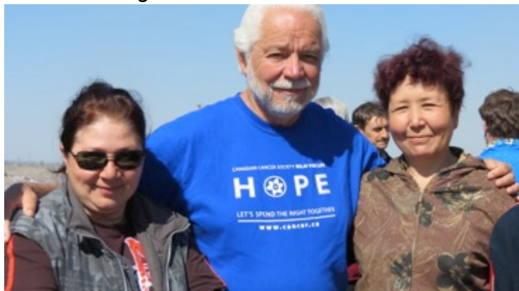
Just starting our journey - first the dump, then the village.

ISKRA VILLAGE: This Muslim village came to the attention of LAMb as a result of a team working with Possibilities International and the Wrights who brought water to the village. LAMb has remained active with the village, taking in food, clothing and other needed items.